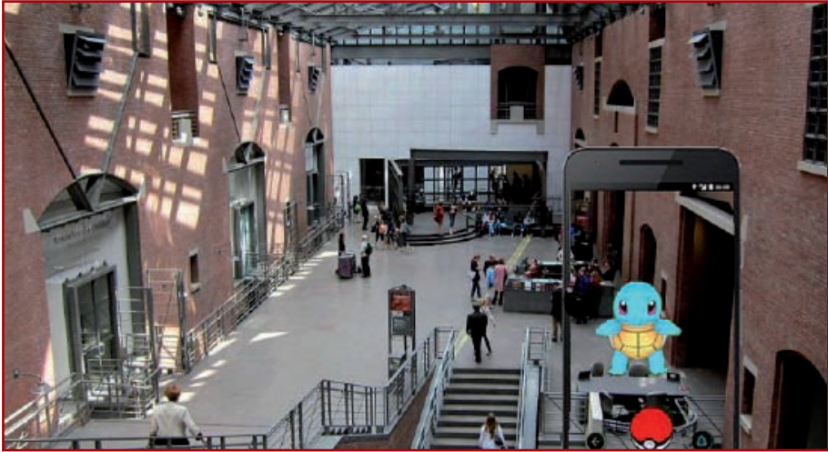
Figure 5. Screenshot, US Holocaust Museum asks Pokemon Go players to stop

In July 2016 the US Holocaust Museum asked Pokemon Go players to stop. A spokesman for the museum in Washington said that «playing the game inside a memorial to victims of Nazism was “extremely inappropriate”» 31 The Arlington National Cemetery, just three miles away from the museum, had also warned off Pokemon players.