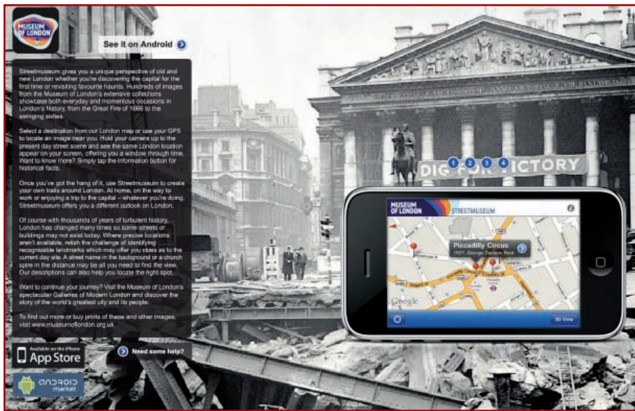
Figure 9. Museum of London, StreetMuseum 2.0, 2014

hidden histories of the city on the especially designed app through the geo-tagged points on the Google-map of the city. The alluring overlays of the contemporary live scene were superimposed side by side together with the historic images drawn from the Museum of London's extensive art and photographic collections. The narrative was further enhanced by the historical information form the curatorial interpretation. Sadly, Streetmuseum is no longer available at the moment but the Museum of London has several other excellent apps for visitors 35 .