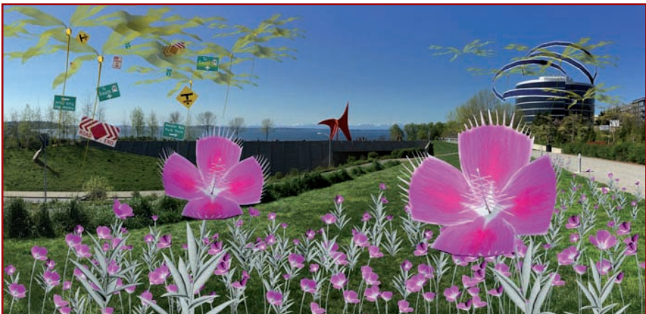
Figure 8. Gardens of the Anthropocene , Augmented Reality Installation by Tamiko Thiel, 2016

Another AR project launched in 2014 took visitors outdoors again. This time the host was the Museum of London and the AR experience took place across the Streets of London 34 . Streetmuseum 2.0, developed with creative agency Brothers and Sisters, invited visitors to visit sites across London where they could evoke