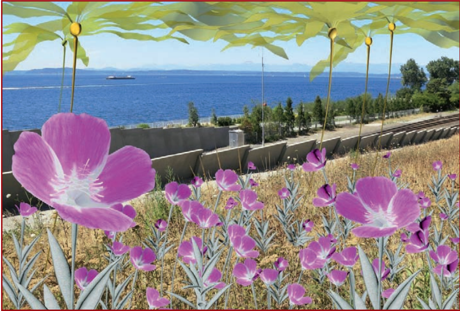
Figure 7. Gardens of the Anthropocene , Augmented Reality Installation by Tamiko Thiel, 2016