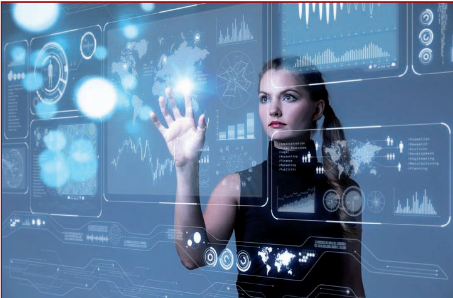
Figure 2. Screenshot from the movie Minority Report , 2002

Each and every one of us will be able to interact in the Mirrorworld; not simply by building a map of our own island, and protecting it from marauders, and not just “wandering” around the facades that we know from Google Earth. We will still do our shopping on Amazon and all its clones and will continue to swap images and experiences as we know from social networks; the major difference is that it will all be happening in 3D. This means that daunting software and hardware solutions still need to be resolved. But they are coming. 3D technologies are emerging all around us. A compelling solution could be floating screens we evoke in the space surrounding us – the kind of interaction we watched as Tom Cruise's iconic role as Chief John Anderton in the movie Minority Report (2002) 23 whose sci fi world was populated with gesture-activated screens.