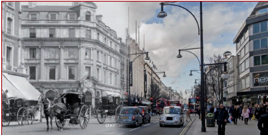
Figure 10. Christina Broom, People and traffic in Oxford Street around the turn of the 20th century