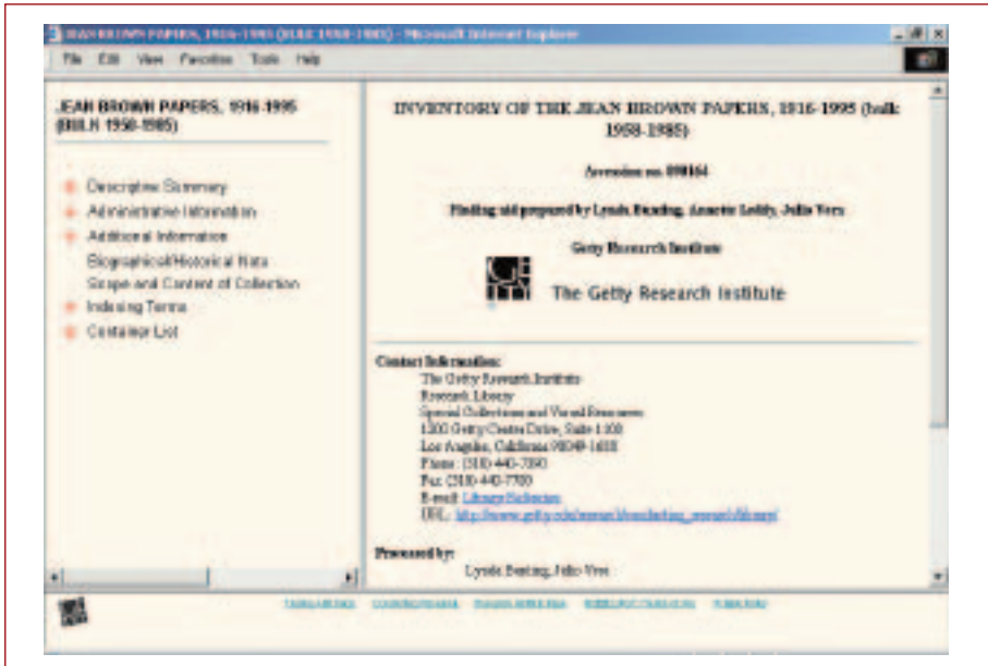
Figure 2. EAD (data structure/data format) and DACS (data content) used at the collection level for an archival collection with a common provenance that includes individual art objects.